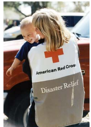
American Red Cross Workshops

making skills training for the mental health practitioner to use during a disaster. After completing this course, participants will be better prepared to take on a leadership role during a disaster. Topics include working with staff/volunteers in Health Services and Client Casework Services; the chain of command and the Incident Command System; the role of the mental health staff and staffing an area to meet the needs of clients.